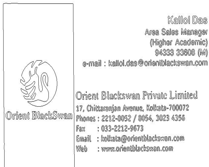
Figure 4.3: Output - Sobel Operator