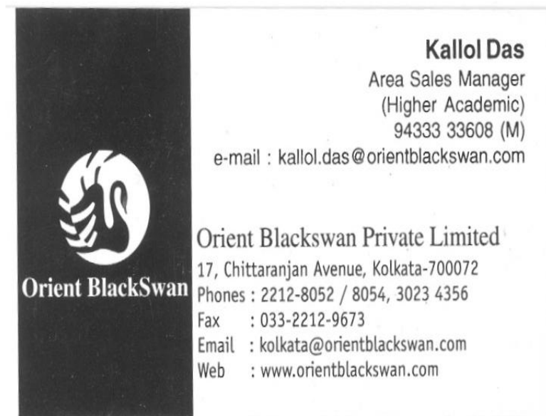
Figure 4.7: Output - ForegroundBackground method