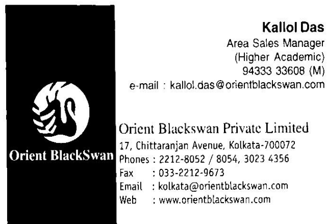
Figure 4.1: Output - Otsu's method

Experimenting with different kind of business cards and varying the value of 'k' we found that for k 100, the cards respond well and give better recognition of characters. At the moment our algorithm doesn't give 100% accurate results but it performs better than some of the existing algorithms like - Otsu's , Niblack's and Edge operator but in general Sauvola's technique outperforms our technique.